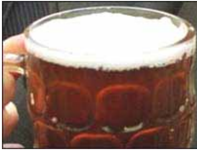
Ale experts say beer is supposed to be cool and refreshing

Ed says: The other extreme can be equally as bad with flash cooled beer turning your teeth on edge.