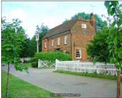
The Red Lion at Preston

Getting home is now the final part of the day's tour. 321s continue to Luton at 19.53 and 20.53 or to St. Albans at 20.25 and 21.25, allowing those from the east to catch the last 724 at 22.30.