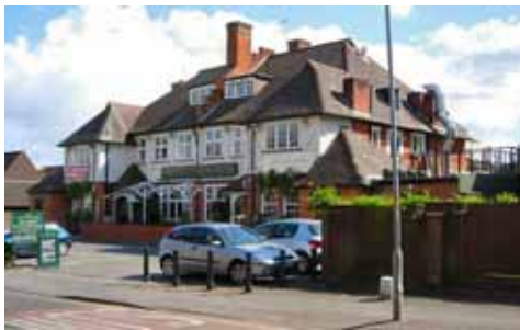
The Southern Cross, Watford