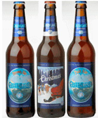
Greenland beers – Pale Ale and Brown Ale (both beers at 5.5% ABV)

It is the first ever Inuit microbrewery - located in Narsaq, a hamlet 625km (390 miles) south of the Arctic Circle.