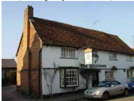
The Hollybush in Redbourn, above, is also owned by Brakspears.

While Brakspear is a relatively small pub company, its 104 venues are well known, especially to television viewers. Its pubs, frequently timbered buildings on the fringe of village greens, have become stars thanks to Midsomer Murders , The Vicar of Dibley and most famously Chitty Chitty Bang Bang , which featured the Tudor-era Bull & Butcher in Turville (near High Wycombe, Bucks).