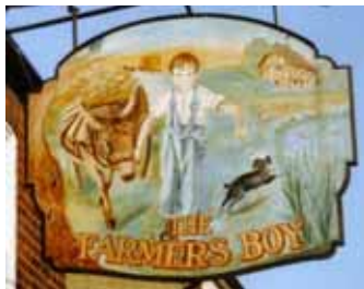
Then and now. Signs of change at the Farmers boy.

and admired by CAMRA members and local historians alike. I refer to the Farmers Boy , London Road, now the "TFB".