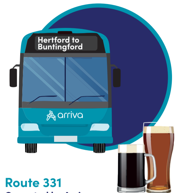
Route 331 Operated by Arriva and A2B Travel Group